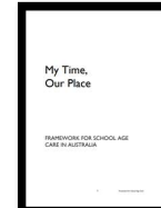
My Time, Our Place; Framework for School Age Care in Australia

Critical reflection: Reflective practices that focus on implications for equity and social justice ( Early Years Learning Framework – refer to Sources ).