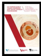
Victorian Early Years Learning and Development Framework

Approved learning framework: A document that outlines practices that educators and co-ordinators must use to support and promote children’s learning. The Early Years Learning Framework (Belonging, Being & Becoming) , the Victorian Early Years Learning and Development Framework and My Time, Our Place; Framework for School Age Care in Australia are approved learning frameworks for use in Victoria ( refer to Sources ).