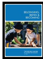
The Early Years Learning Framework 2022 V2 (Belonging, Being & Becoming)